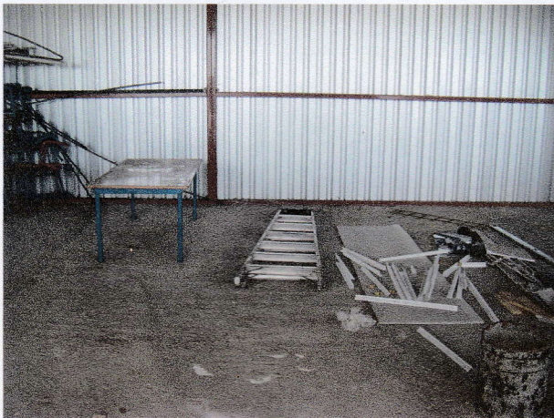
CONSTRUCTION OF TABLES

The second floor is completed and tables are being built (cost less to build than to buy). The children are not yet allowed onto the second floor because it has not been approved by the Ministry of Education.